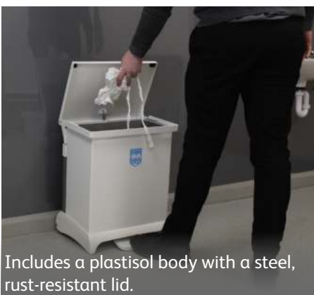
Includes a plastisol body with a steel, rust-resistant lid.