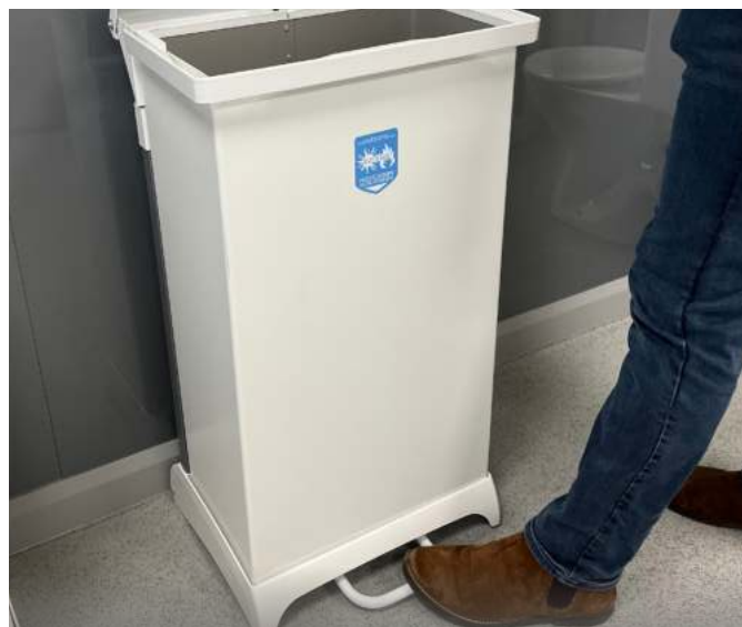
Our Hybrid Sackholders now come with the option of a plastic or metal pedal that lifts up the lid without having to use your hands.