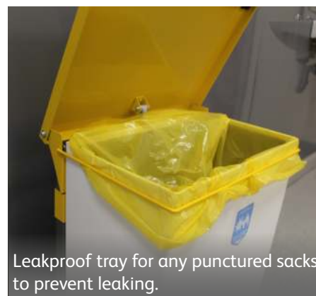
Leakproof tray for any punctured sacks to prevent leaking.