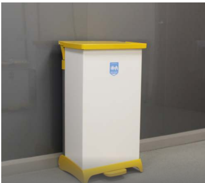
These Hybrid Sackholders get their name due to the galvanised steel lid, ABS plastic base and a plastisol body.