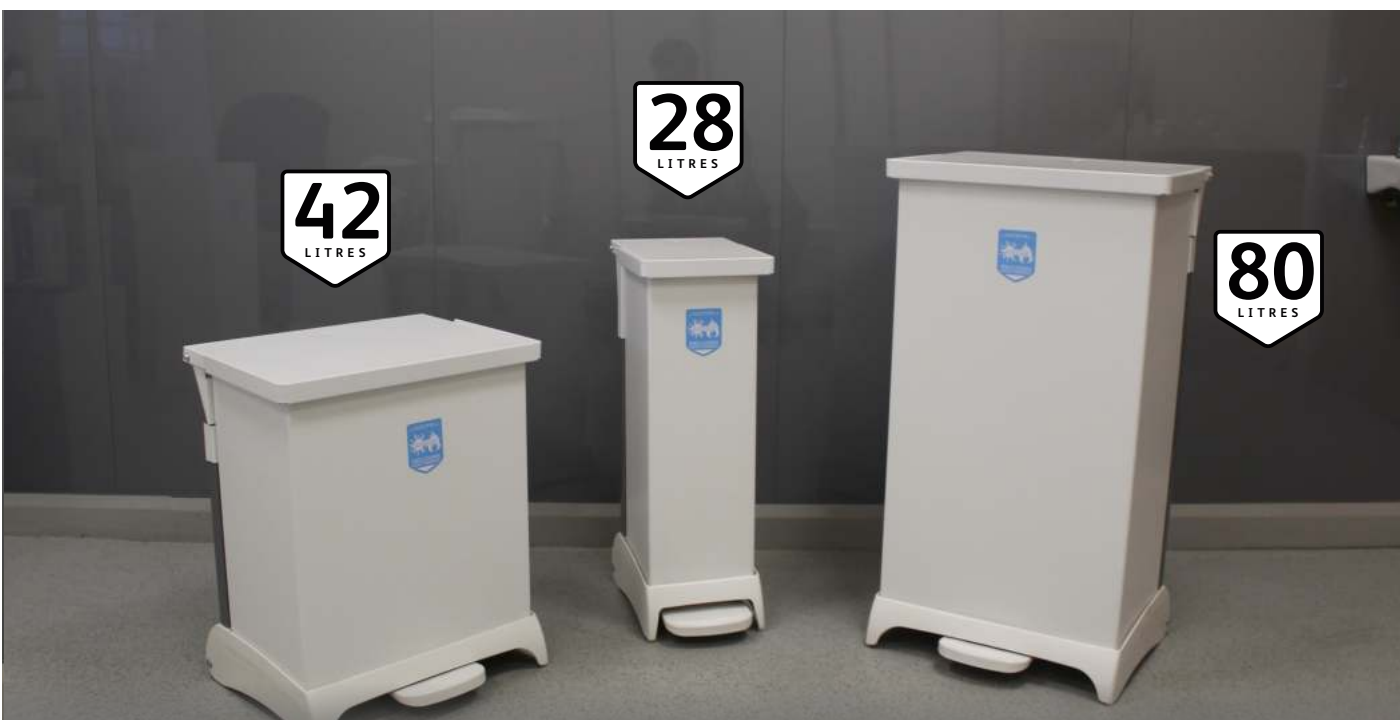
This hybrid, fire-retardant sackholder is available in 28, 42 and 80 litre sack sizes to suit any healthcare environment and offers easy maintenance, in your choice of lid and frame colour to segregate your healthcare waste correctly.