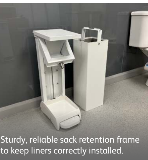
Sturdy, reliable sack retention frame to keep liners correctly installed.