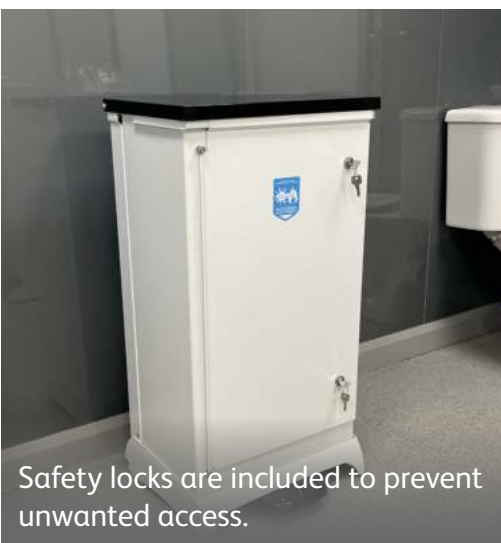
Safety locks are included to prevent unwanted access.