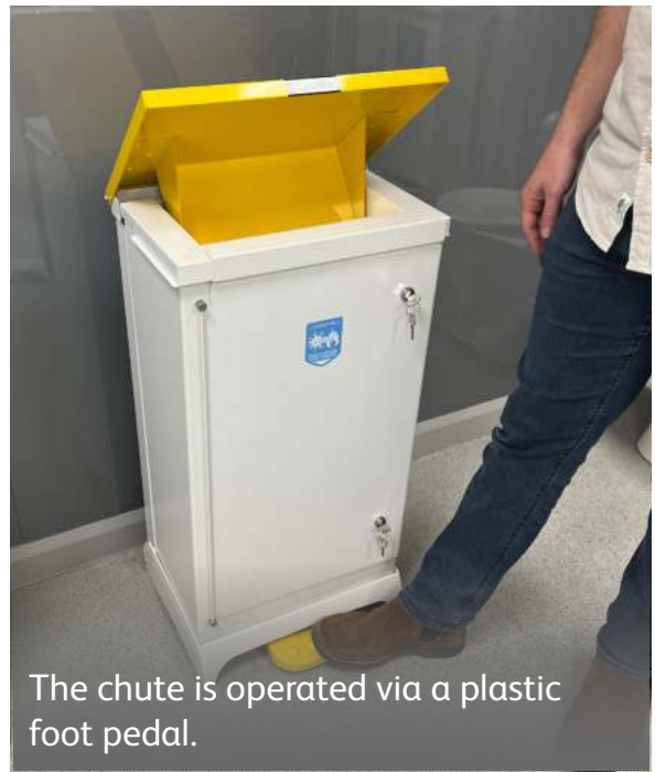
The chute is operated via a plastic foot pedal.