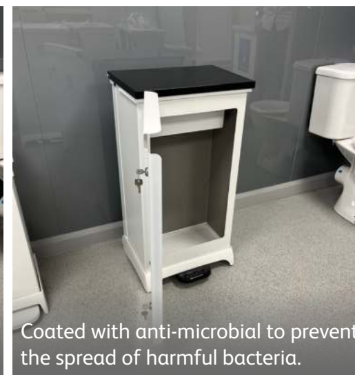
Coated with anti-microbial to prevent the spread of harmful bacteria.